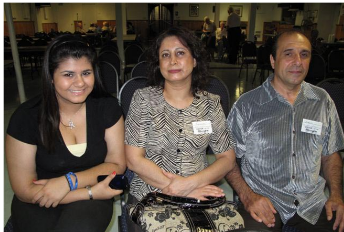
New members wait for the show to start.